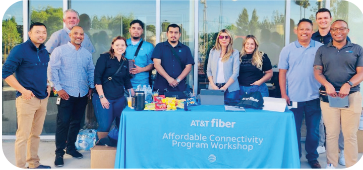
Our AT&T support team at an ACP workshop in Orange County, California.

The Affordable Connectivity Program is a government program that provides a benefit for eligible households toward their internet or wireless service. To close the digital divide, AT&T visits properties to educate residents on the program as well as eligibility requirements. Residents can visit att.com/acp for more information on the Affordable Connectivity Program.