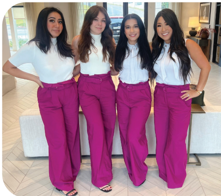
Folksong Flowery Branch

During move season, over 1,500 communities participated in the AT&T Fiber Frontline Challenge. One hundred properties won a $500 AT&T Visa® Reward Card for connecting residents to hyper-fast, reliable internet with AT&T Fiber.® Congratulations to all the winners and thanks to all who signed up for the challenge.