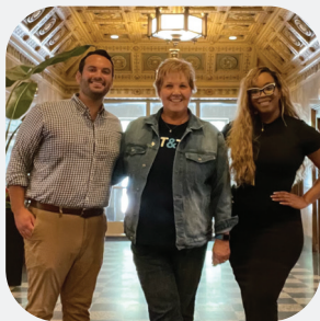
Community Team at Park Pacific